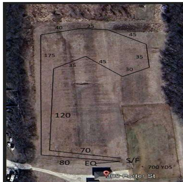
Sunday – Yards – 700 Yards